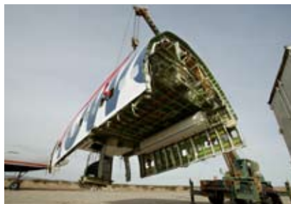
The Wing House Project in Malibu

* Innovation and Design Process - is present everywhere you turn including a battery operated grid to monitor energy use and a Dyson hand dryer that dries with a jet of cool air in seconds. In addition, motion occupancy sensor, daylight sensor and dimmable fluorescents contributed to additional energy savings.